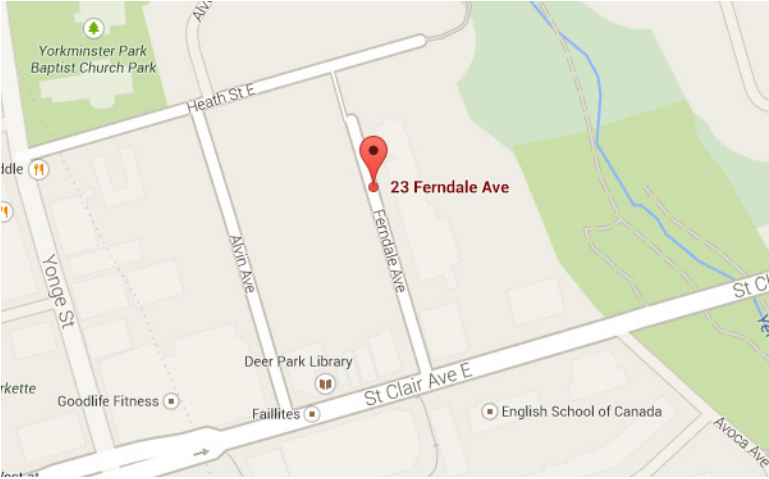
School Parking Lot

School parking lot is accessible from Heath Street only. Ferndale Ave. does not connect to Heath St., so you must take St. Clair Ave. to Alvin Ave., and then to Heath St.